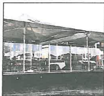
CAFFE CENA: This cafe has been serving up classic Italian dishes in a friendly and relaxed atmosphere for more than six years.

"It would make the street livelier and would be a reason to come down to Prospect Rd, rather than just drive past it."