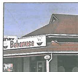
BABANUSA: Proudly claiming to be Australia's only Sudanese restaurant, Prospect Rd has been home to Babanusa since 1995.