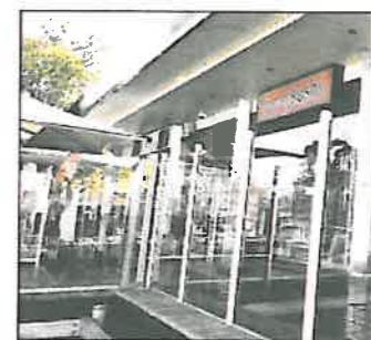
MOMIJI SUSHI: Momiji is celebrating two years on Prospect Rd and serves up fresh and tasty sushi for breakfast, lunch and dinner.