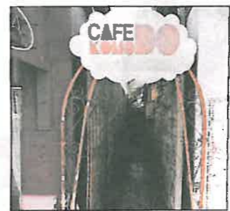
CAFE KOMODO: It is a haven of retro, comfy cool and laid back tunes, specialising in healthy, hearty food and has an all day breakfast menu.