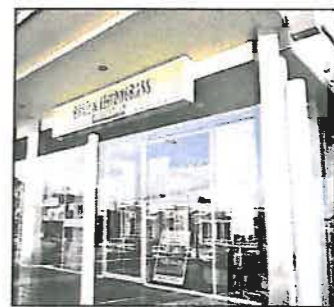
BASIL & LEMONGRASS: From North Adelaide, found a new home on Prospect Rd four months ago offering tasty Thai dishes.