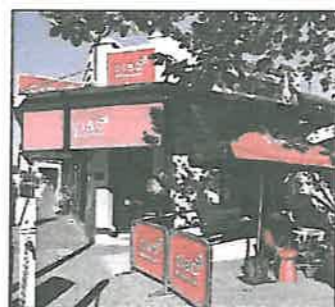
CIBO ESPRESSO: Nestled next to the Vine Street Plaza, this popular coffee hub brings a little bit of Italy to Prospect Rd.