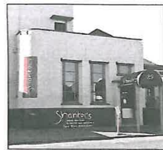
SHANKER'S RESTAURANT: Shanker's fine dining restaurant prides itself on its southern Indian cuisine and a quality wine list.