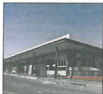
CIKOLATTE: The Turkish restaurant came to Prospect Rd three months ago and highlights include its flavoursome coffee.