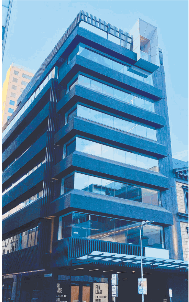
Maras Group's refurbished office building at 74 Pirie Street in the city secured tenants for all six floors during the height of the COVID-19 pandemic.

"Since COVID we had to think carefully about whether a move was the right thing to do, but the idea of being alongside (Osteria) Oggi and Abbots and Kinney was a real reward. Soi38 will open a new "student-focused" eatery at its Pulteney Street premises later this year.