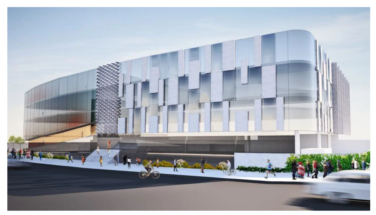
🖸 Maras Group's proposed office development at Richmond Rd, Keswick

"We are looking at different design elements that aren't the norm in Adelaide, but of course the design has to fit the environment as well."